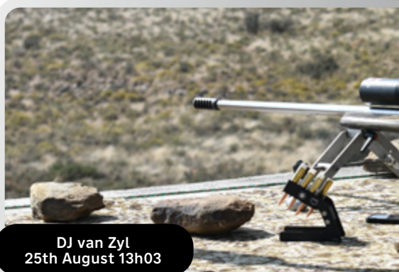
DJ van Zyl 25th August 13h03