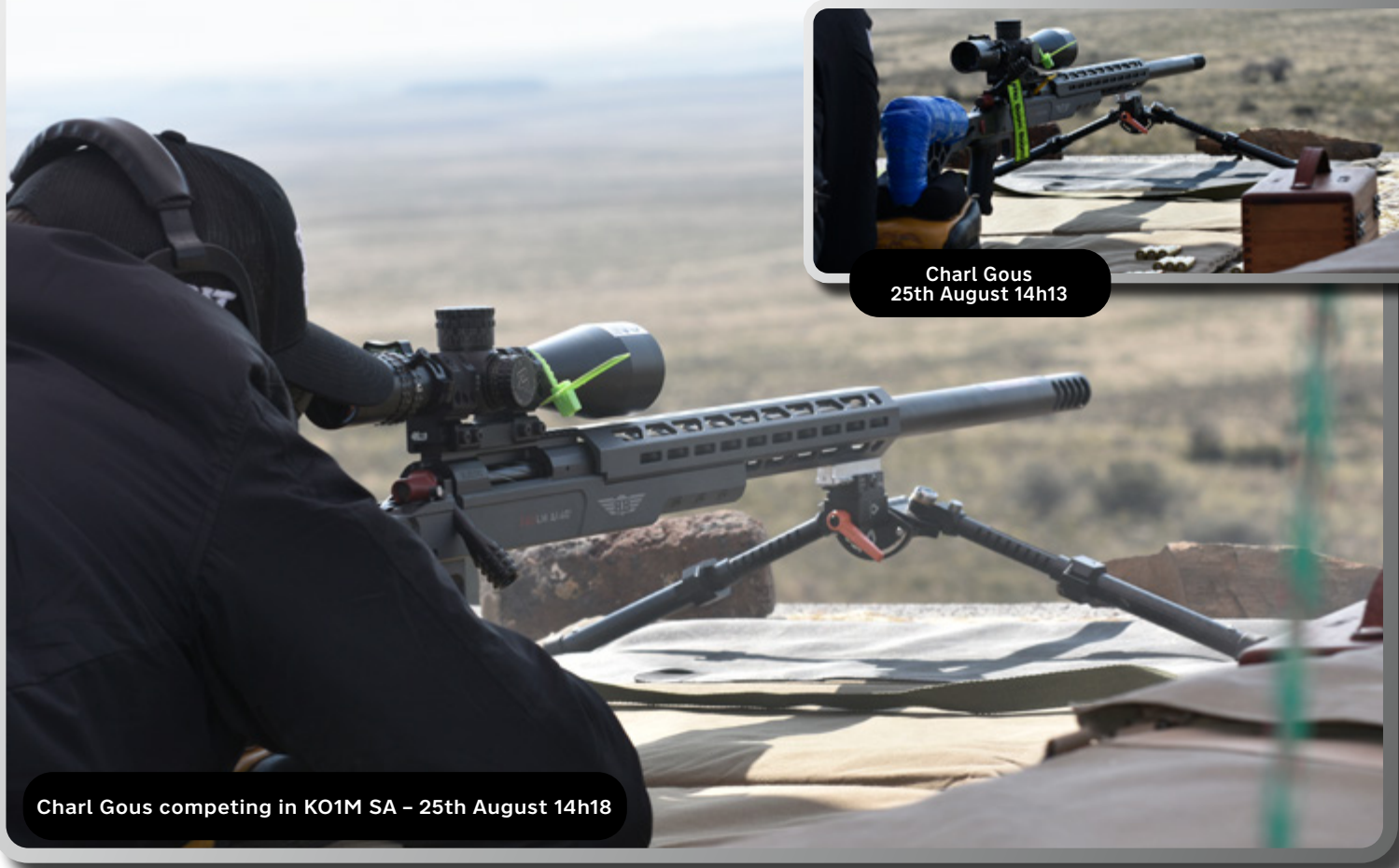
Charl Gous competing in KO1M SA - 25th August 14h18