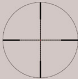
Di MD reticle ● Illuminated Dot