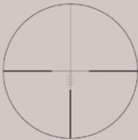
4A SB reticle ● Illuminated Dot